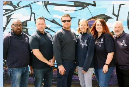
Outreach Services and the MDT